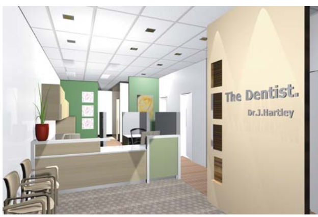
Above: A 3D rendering of the proposed reception area design. Below: Reception area prior to work commencing.