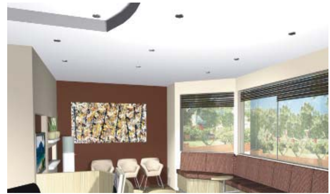
3D renderings developed in the design phase.

modeling was uncannily accurate and allowed us to visualize what the practice would like before it was built. We found this design tool extremely helpful."