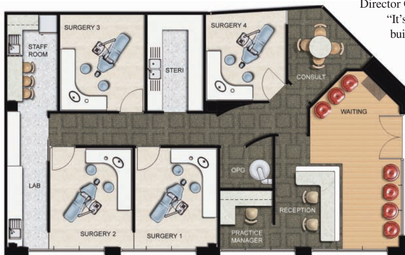
SPARKLE DENTAL W.A.