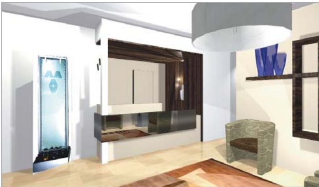
3D rendering developed in the design phase.

Colin Priestland, suggested I contact Medifit as they had a very good reputation in Queensland with very positive feedback from the dentists concerned. They all stated that the quality was excellent and that they offered a very professional service.