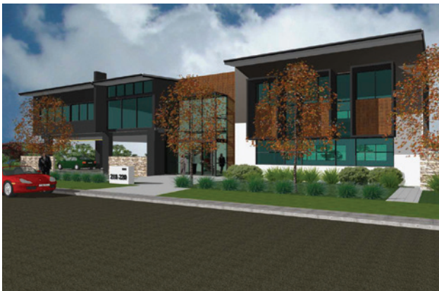
3D rendering of the practice in the conceptual stage.

One of the first milestones for any project of this type is obtaining development approval from local council. The approval process was complicated as the project called for combining two lots into one in addition to the typical change of use application. Medifit were able to compile all the relevant information and put it before council for approval following a communication strategy developed over 14 years in the space. The comprehensive DA submission was key to a streamlined approval and the company was breaking ground on the new practice site by early 2013.