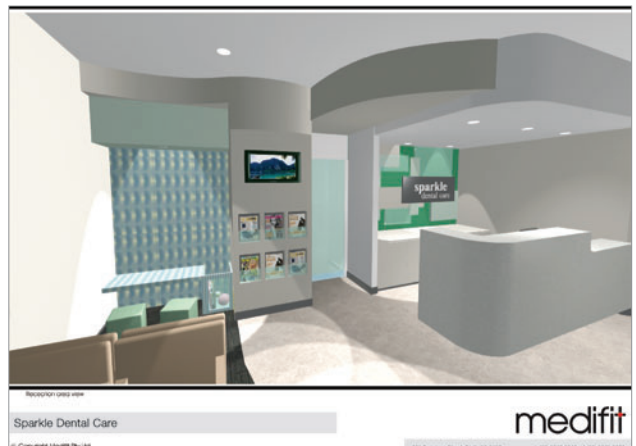
3D rendering developed in the design phase.

simple extension and refurbishment, the building now required considerable reconstruction and site drainage work.