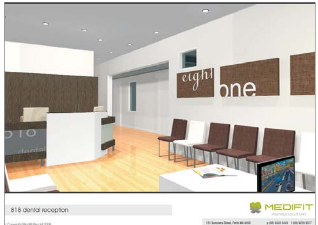
3D renderings developed in the design phase

“Firstly, the building next door would start construction in October 2009 and needed to be completed by Christmas but the joining of the building needed to occur over the Christmas period so we could commence work in January. Anyone who has renovated before will tell you that the building industry goes offline around Christmas and into January. This did not deter Medifit and they agreed to make it happen.