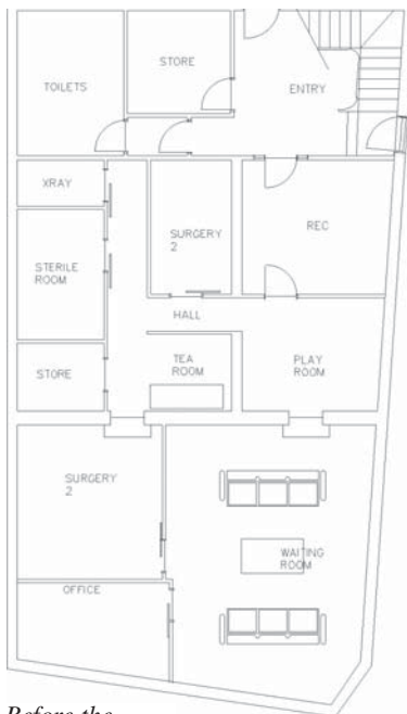
Before the renovation