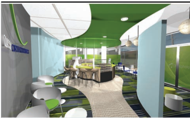
Class 1 Ortho Rockingham