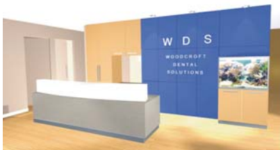
3D CAD drawing prior to construction

extra costs associated with providing the services so we went ahead. As part of his brief he also required a combined sterilisation area and lab; staff area; storage; an office; and reception area to be incorporated into the 126m 2 space.